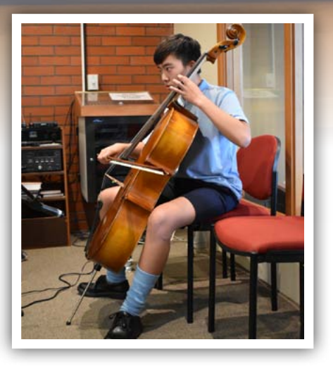
The mass in Timaru was beautifully supported by both student and staff musicians